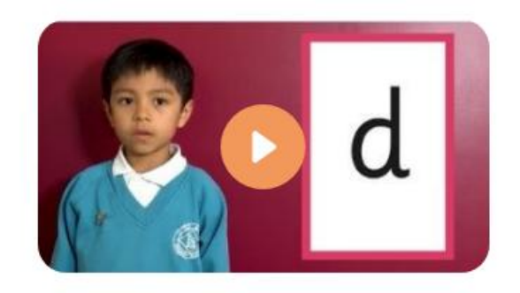
Phase 2 sounds taught in Reception Autumn 1